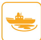
Spill Containment on Water