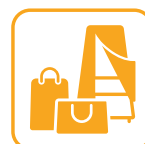
Bags & Covers