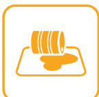
Spill Containment on Land

The owner hereby waives all liability claims against Chatoyer, its employees and directors, its partners and affiliates and its distributors and retailers except as specifically provisioned for in the form of a written product warrant, and then liability is limited only to the purchase price of the product excluding installation or any other costs or damages.