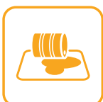
Spill Containment on Land

The owner hereby waives all liability claims against Chatoyer, its employees and directors, its partners and affiliates and its distributors and retailers except as specifically provisioned for in the form of a written product warrant, and then liability is limited only to the purchase price of the product excluding installation or any other costs or damages.