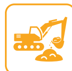
Silt & Sediment Control