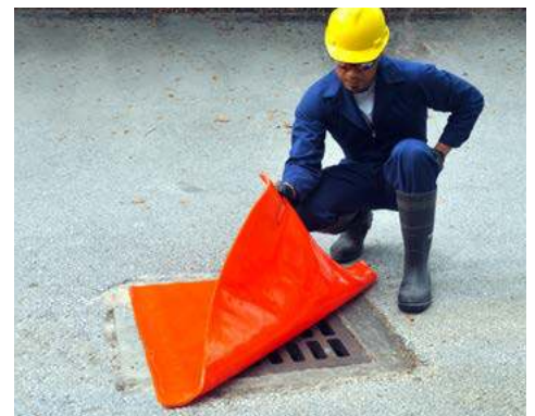
Ultra-Drain Seal helps seal off drains to minimize problems!

* Will cause the Ultra-Drain Seal™ to swell temporarily but not degrade.