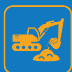
Silt & Sediment Control