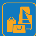
Bags & Covers