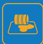
Spill Containment on Land