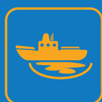
Spill Containment on Water